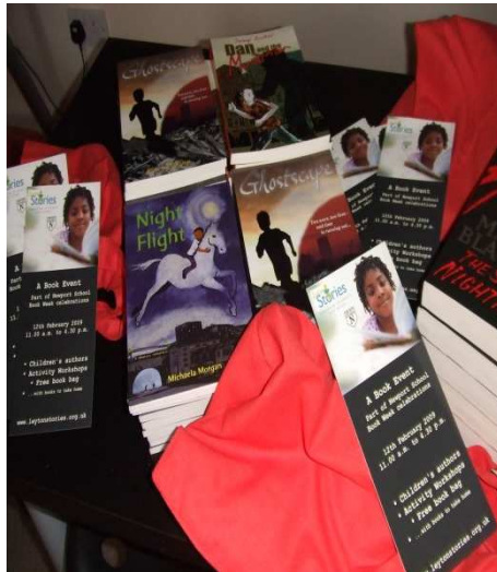
Book bags, book marks and free books on the day!